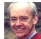
Moderated by Alan Race

Thursday, April 29th via Zoom 6:00 PM - 8:00 PM UK Time