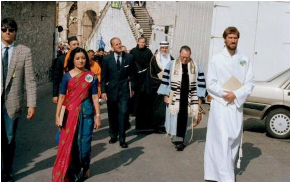
The Duke of Edinburgh with religious leaders at the interfaith summit in Assisi, Italy, 1986

We express our great gratitude for the significant contribution of Prince Philip to the development of inter faith understanding and cooperation for the common good: one that is of ever greater importance in our increasingly diverse society and interconnected world.